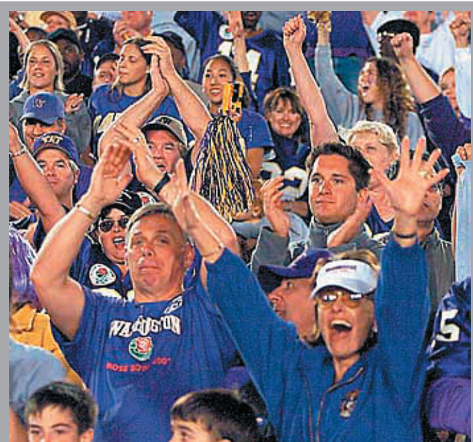
Husky fans are delighted

Huskies facing 3rd and 1 at their own 41.