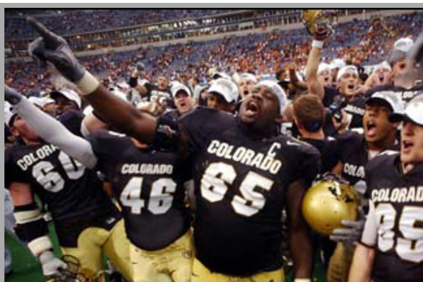
The Colorado offense on song

OSU are not a team to be easily outdone in a shootout, and held their