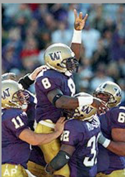
The Huskies celebrate another victory

Washington travelled to Pittsburgh to defend their unbeaten record and got off to a great start, three first quarter touchdowns gave them an early 14 point lead. The Panthers weren't about to give up on their home turf,